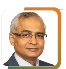
Dr. Neeraj Mittal

Minister of State for Communications, Department of Telecommunications Government of India