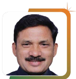
Shri Devusinh Chauhan

Minister of State for Communications, Department of Telecommunications Government of India